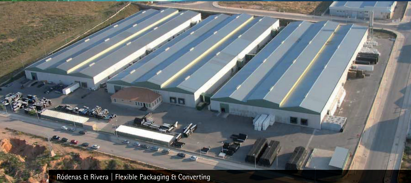
Ródenas & Rivera | Flexible Packaging & Converting